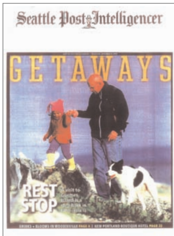
SEATTLE MAGAZINE, NOVEMBER 8, 2006