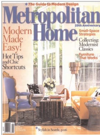
METROPOLITAN HOME, NOVEMBER 2006