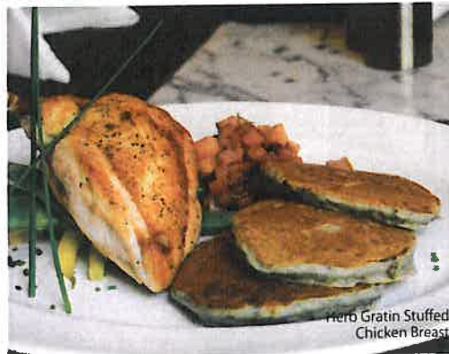
Herb Gratin Stuffed Chicken Breast