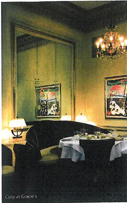
Cosy at Gracie's