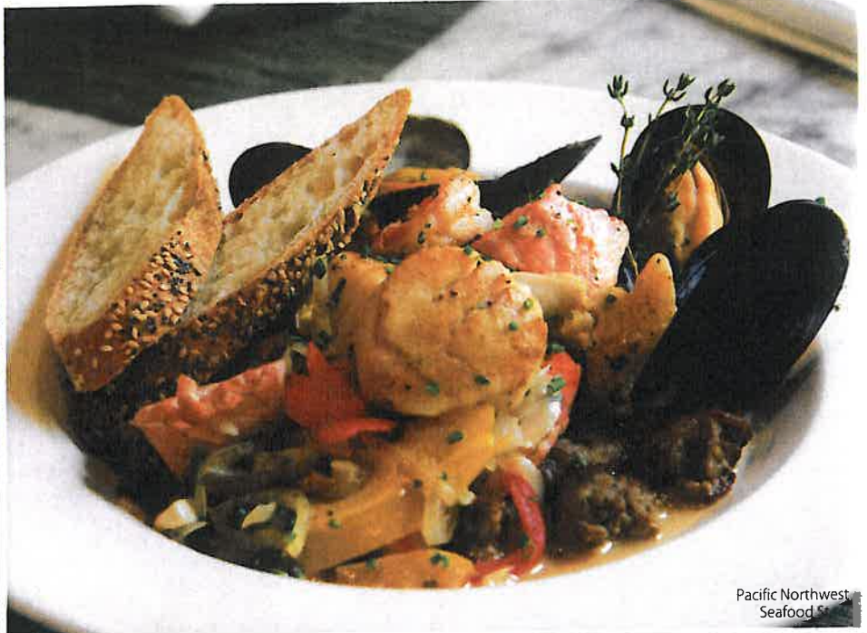
Pacific Northwest Seafood