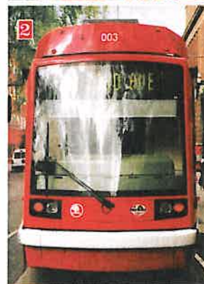
1. Sweets galore at Petite Provence. 2. Portland Streetcar—free and easy.