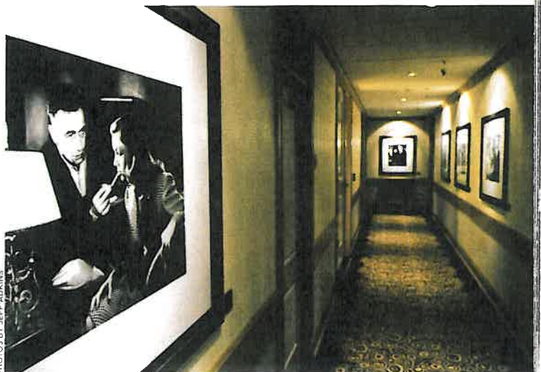
Top right: The Nines hotel occupies a historic building. Bottom right: Hotel deLuxe decor spotlights Hollywood. Left: Olive Or Twist Martini Bar is a Pearl District magnet.